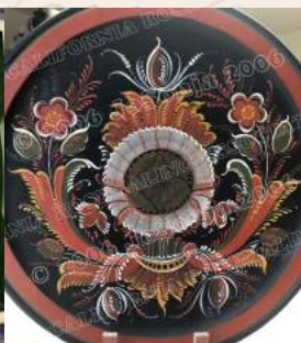
Karen Sheppard Raffle Donation - pedestal plate (© JoSovja 2006)