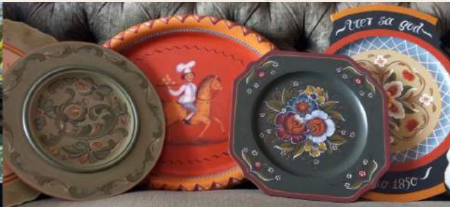
Karen Sheppard -sample of her donations to the CRA Tradeshaw table!